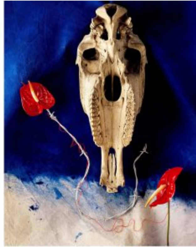
Personal work. Still-life studies with cowrie and skull.

Q: How do you choose the photos that you display on your homepage?